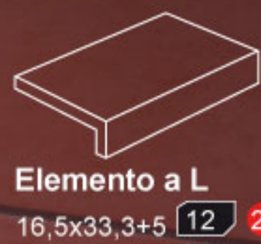
Elemento a L 16,5x33,3+5 12 20