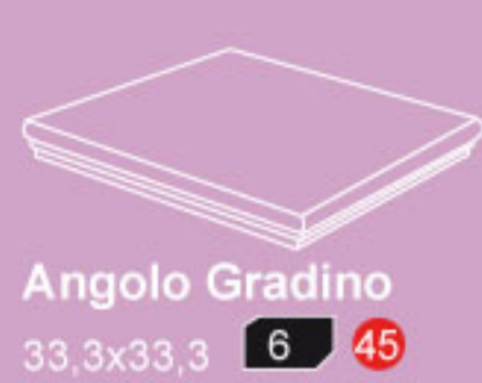
Angolo Gradino 33,3x33,3 6 45