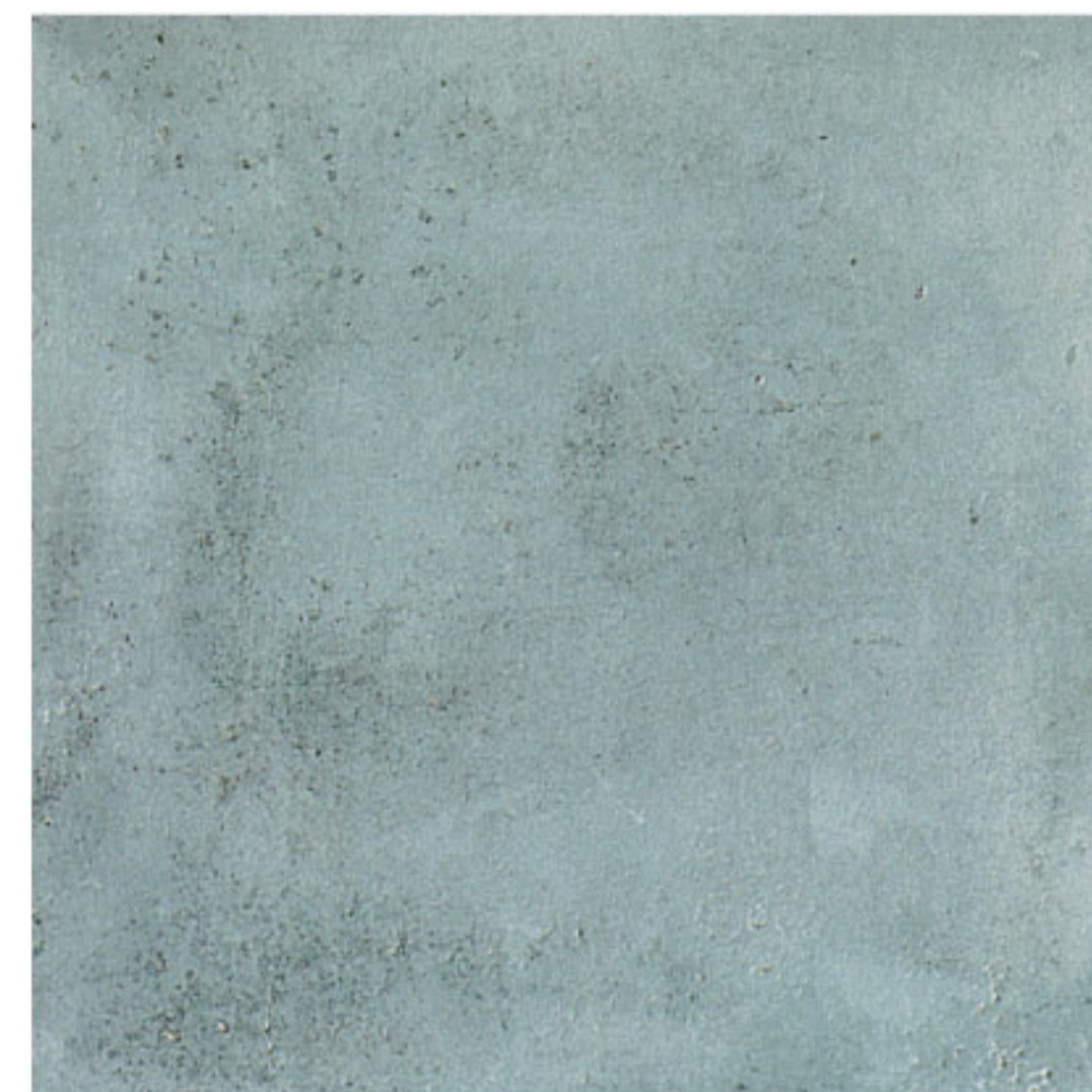
2666 33,3x33,3 Bleu