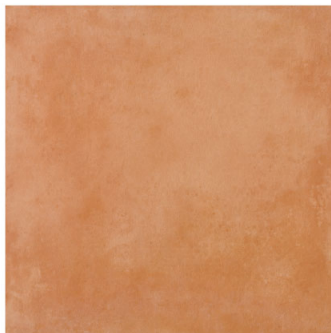
2633 33,3x33,3 Cotto