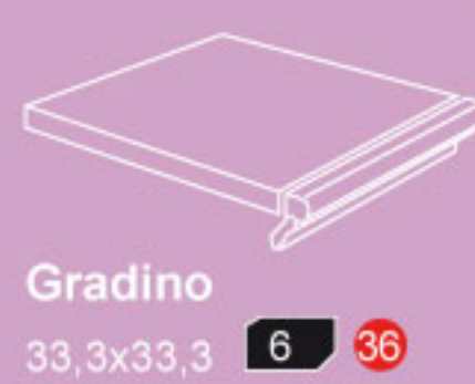
Gradino 33,3x33,3 6 36