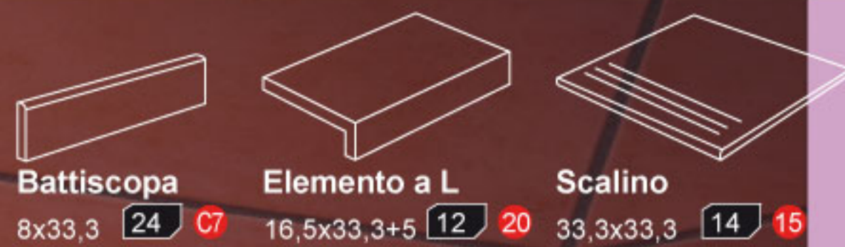
Battiscopa 8x33,3 24 C7