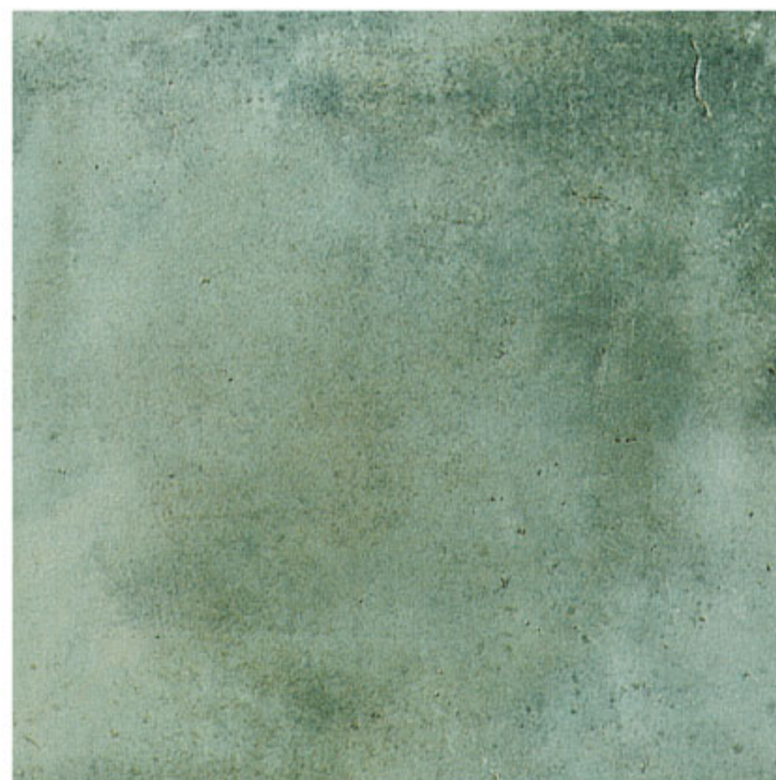
2665 33,3x33,3 Verde