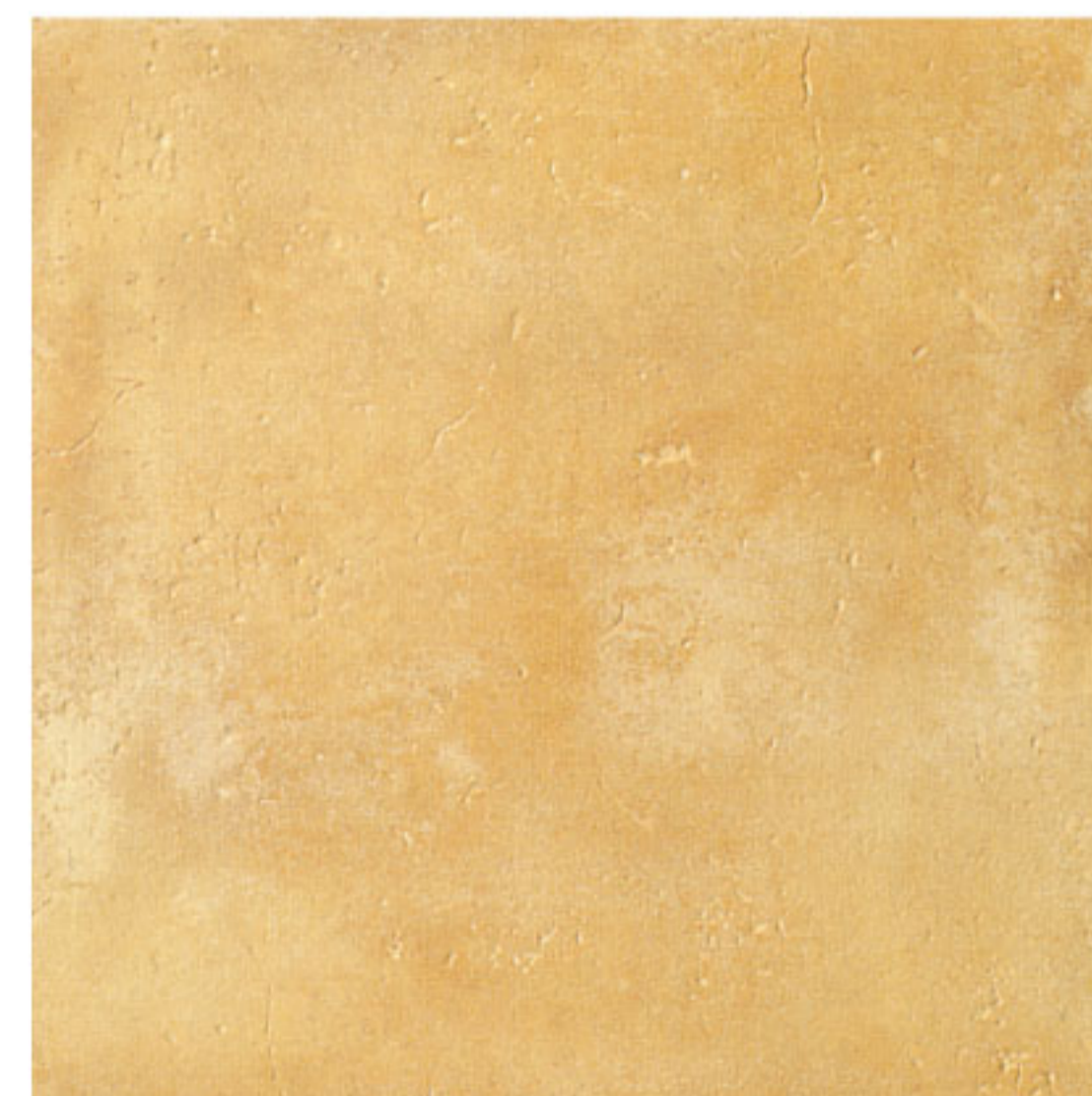
2667 33,3x33,3 Giallo